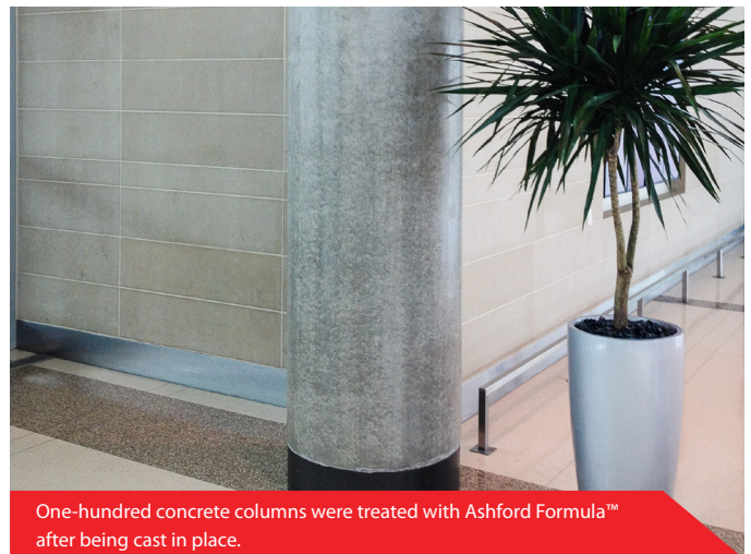
One-hundred concrete columns were treated with Ashford Formula™ after being cast in place.

For more information on the Love Field Modernization Program in Dallas, TX, visit www.lovefieldmodernizationprogram.com .